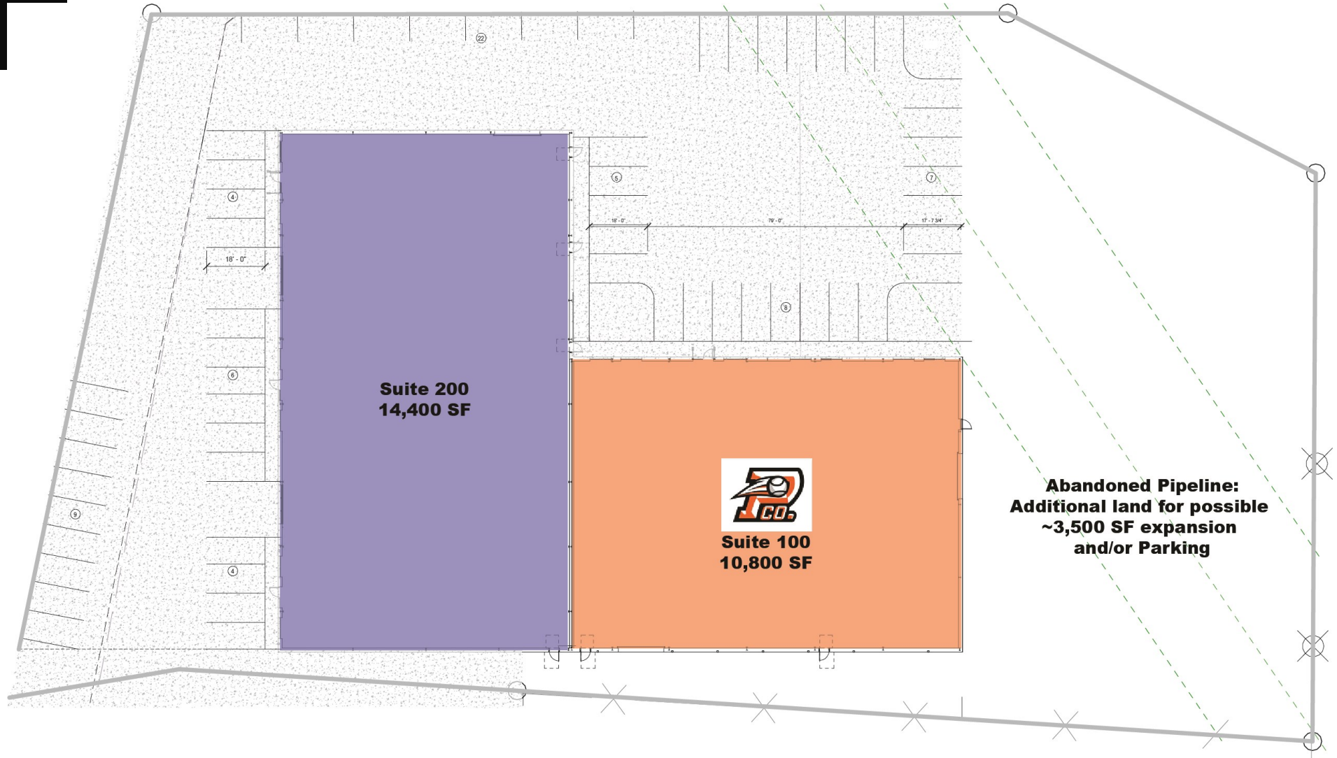
*Approximate Property Lines and Site Plan